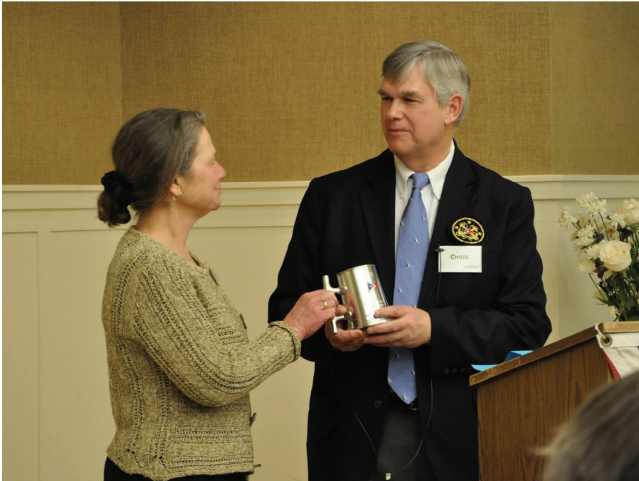
The Watch Changes.