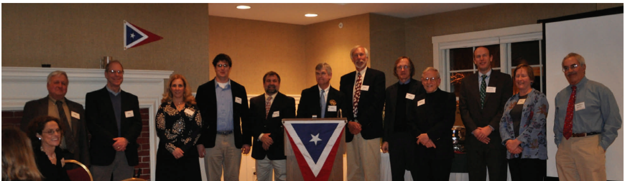
The New Board of Governors

Note: The fourteen-member Board of Governors is divided into three groups/three-year terms, with five members in two and four in the third.